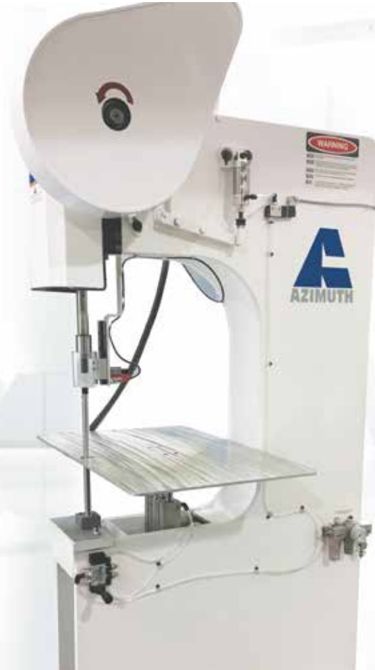
Table Dimensions : 18" D x 30" W